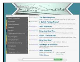
Screenshot taken Apr 28, 2016