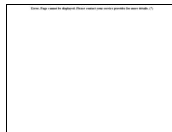
Screenshot taken Nov 18, 2014