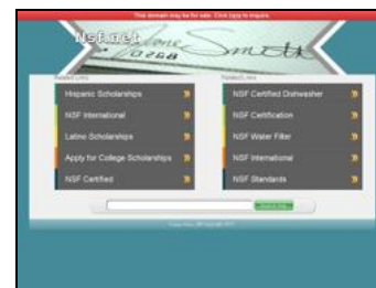
Screenshot taken Oct 20, 2017