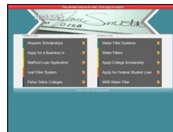
Screenshot taken Sep 4, 2020