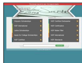
Screenshot taken Oct 20, 2017