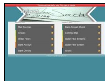
Screenshot taken Aug 20, 2019