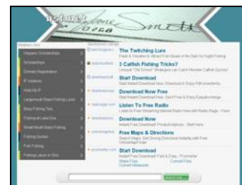
Screenshot taken Apr 28, 2016