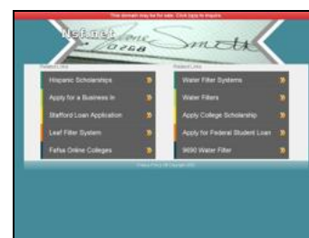
Screenshot taken Sep 4, 2020