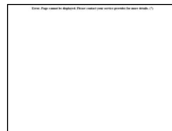
Screenshot taken Nov 18, 2014